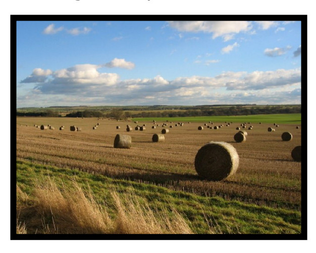
'The land yields its harvest; God, our God, blesses us'

Sunday 7th November Morning Worship at 11.00am followed by special prayers