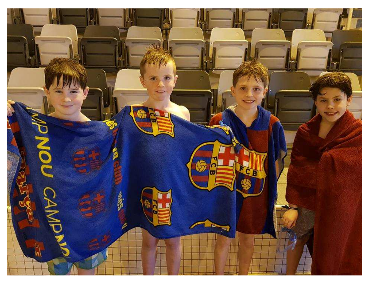
Junior Section Swimming Team