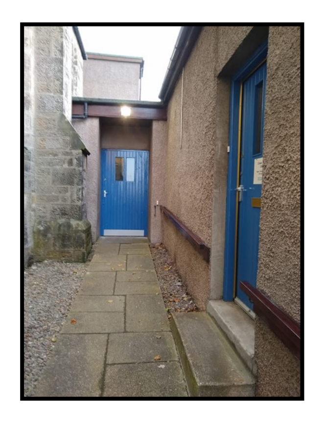
CROWN 20/20 GROUP