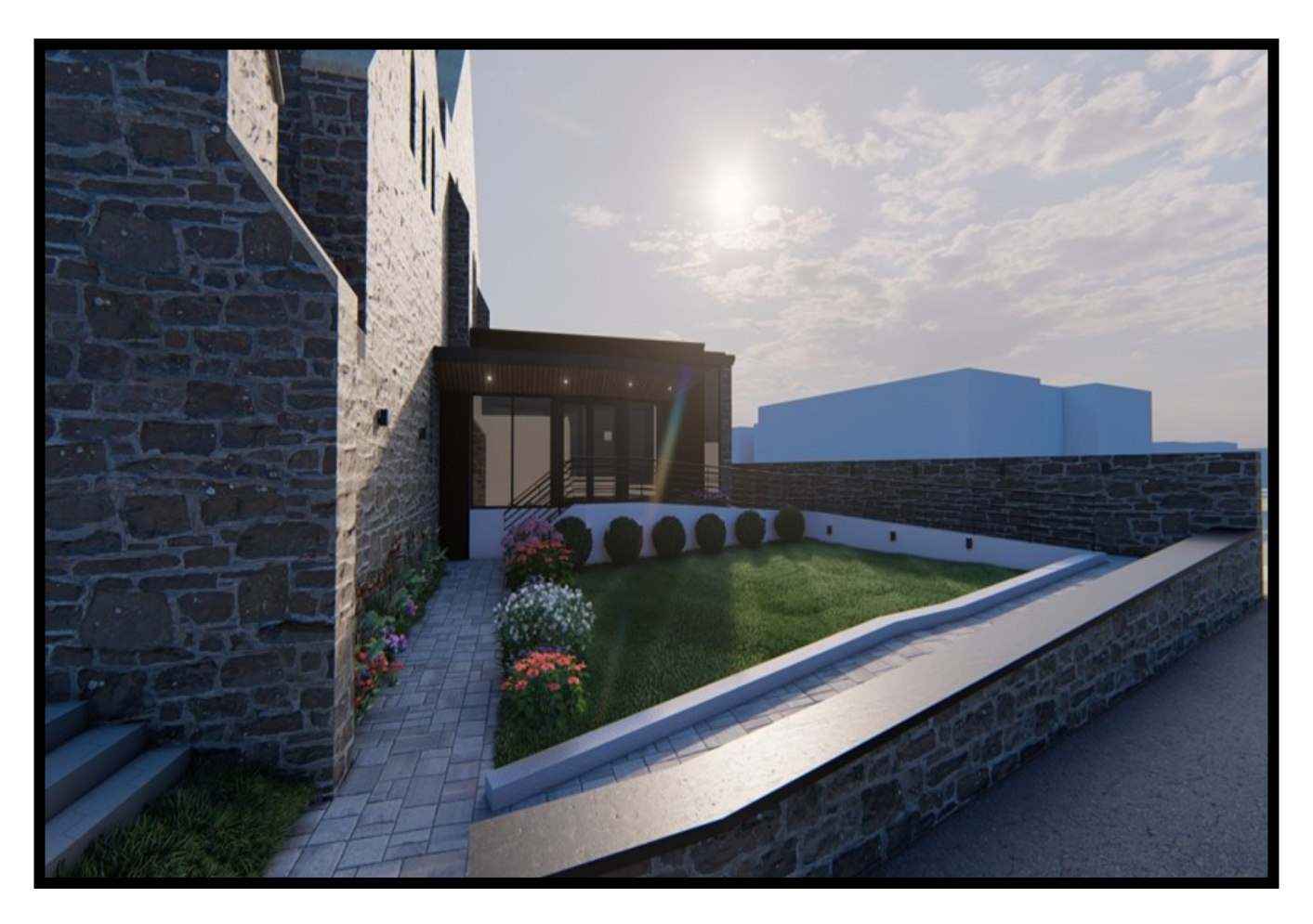
Visualization of the new main entrance to our buildings.

The main emphasis in these discussions has been on ensuring that when we meet for worship all will have been done to maintain those aspects of our heritage which enhance our worship while allowing flexibility both in layout for worship, and layout for weekday activities. At the same time, we have spent considerable time in refining the concept of a main entrance and what is needed for access for able and disabled, during the day and on a dark winter evening that would be welcoming and encouraging for newcomers and regulars to our buildings.