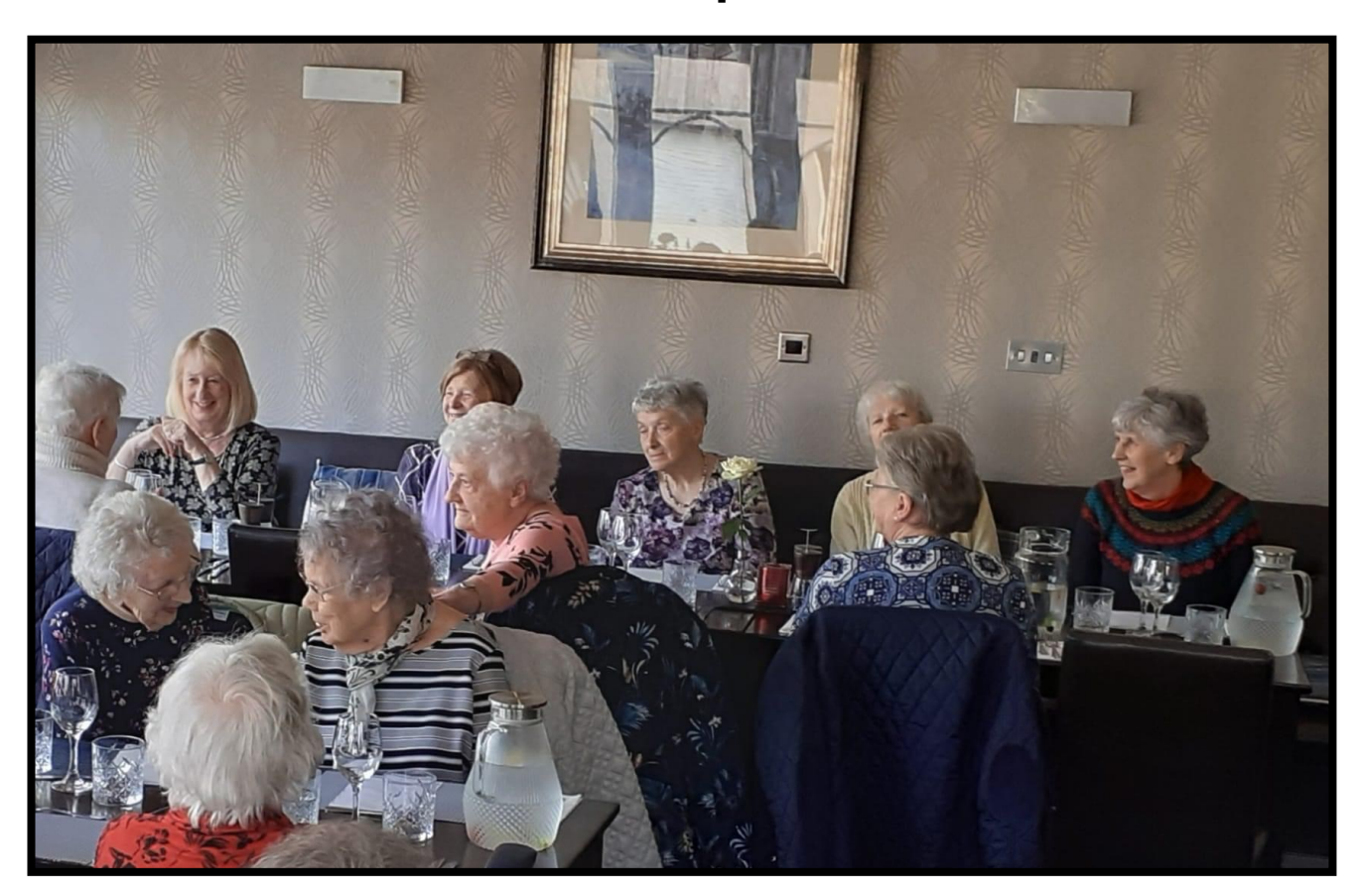
'Best thing I've done is join the Friendship Club ' to quote one of our members

You can't get a better accolade than that.